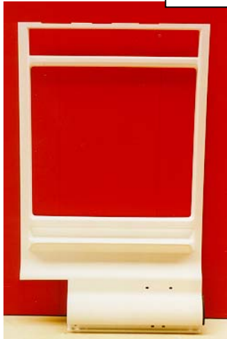
Side-wall panels / window frames..