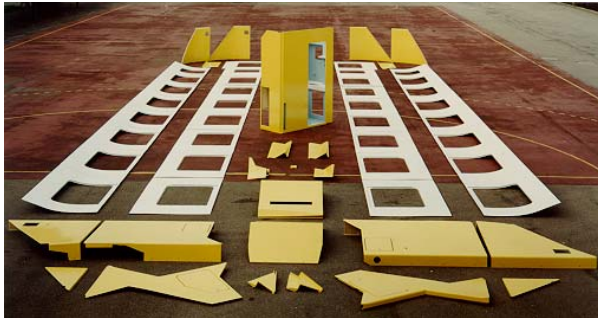
Interior lining components...