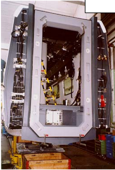
Adapter frames for coach corridors...