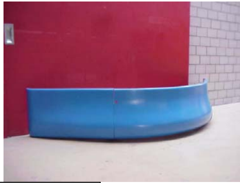
Front- and rear skirts for the Göteborg tram