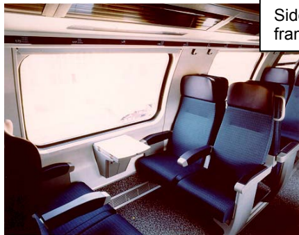
Side-wall panels and window frames...