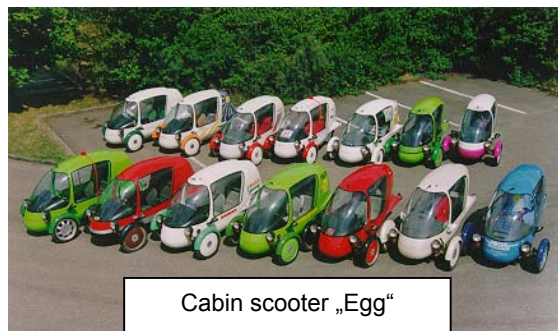
Cabin scooter „Egg“