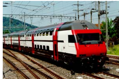
...for the IC-2000 operated by SBB