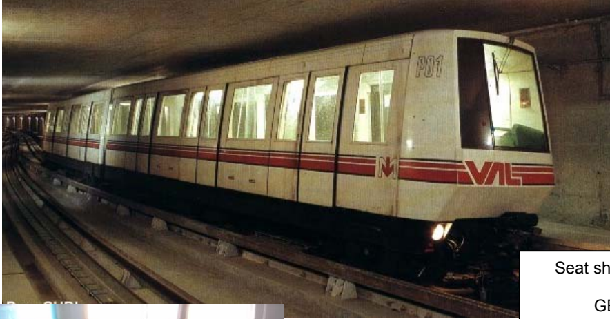
Seat shells for Transpole Metro, Lille (France), delivered to GBM Gleisbaumechnik (Germany)