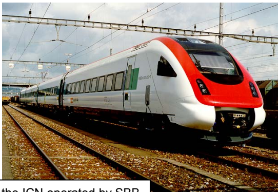
...for the ICN operated by SBB