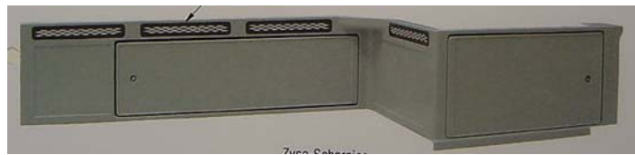
GRP components with hinged covers, locks and ventilations grids