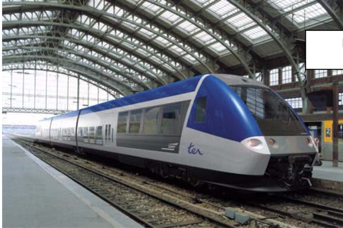
Interior lining components for AGC / SNCF (Bombardier France)