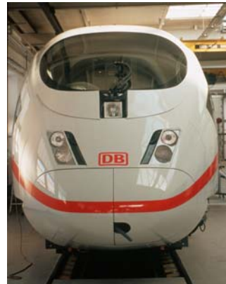
...for the ICE-3 operated by DB