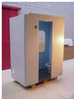
Toilet / Lavatory cabins