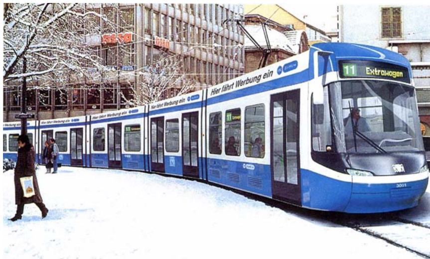
Interior lining components for the „COBRA“ Tram Zurich