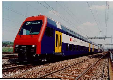
...for the S-Bahn in Zürich