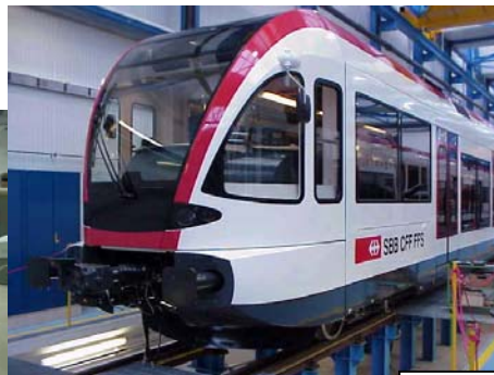
Front- and rear skirts for Stadler commuter trains