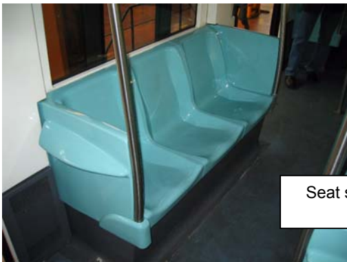
Seat shells and arm rests according to the french norms NF F 16-101 / M1/F1